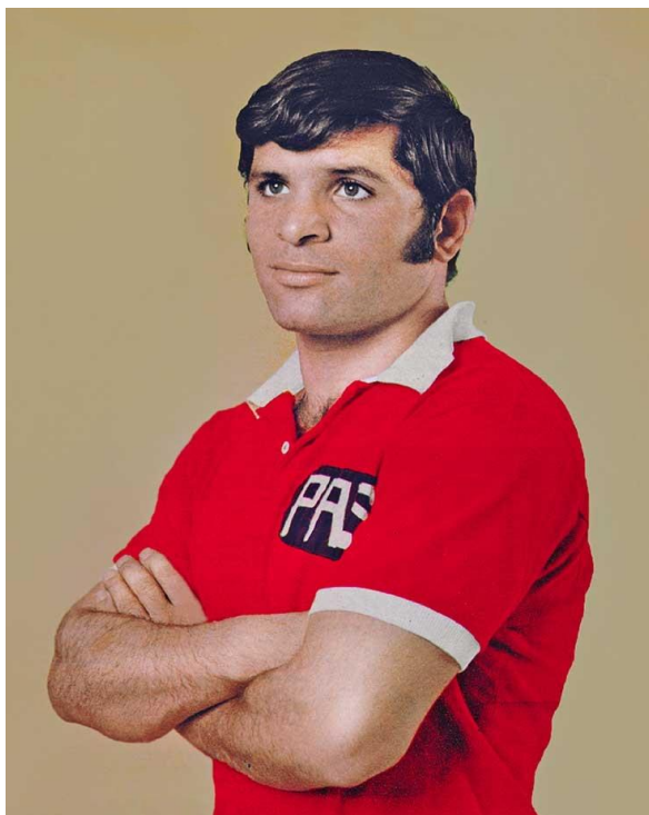
wrestler Gholamreza Takhti as examples

The party concludes by wishing the national team success in the World Cup while emphasizing that supporting the team is an expression of support for a shared national asset—not for the Islamic Republic.